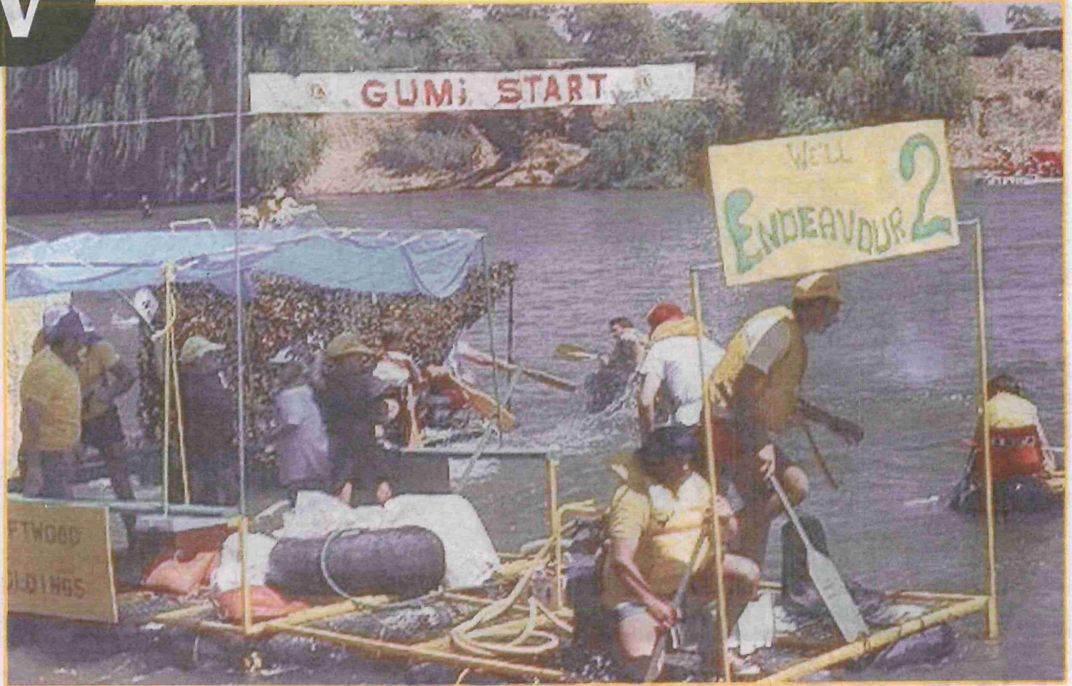
The "We'll Endeavour 2" takes off for the starting line at the Brick Kiln Reserve.

CSU Regional Archives to open the first Saturday of every month. Beginning in February 2011, the CSU Regional Archives will be extending its opening hours to include the first Saturday of every month. On these days the archives will be open from 10am to 3pm. The next Saturday opening will occur on March 5, 2011. This trial initiative has been put in place to cater for those researchers who are unable to visit the archives on weekdays during normal business hours. It is hoped that enough researchers and visitors will avail themselves of this service to warrant it becoming a permanent occurrence.