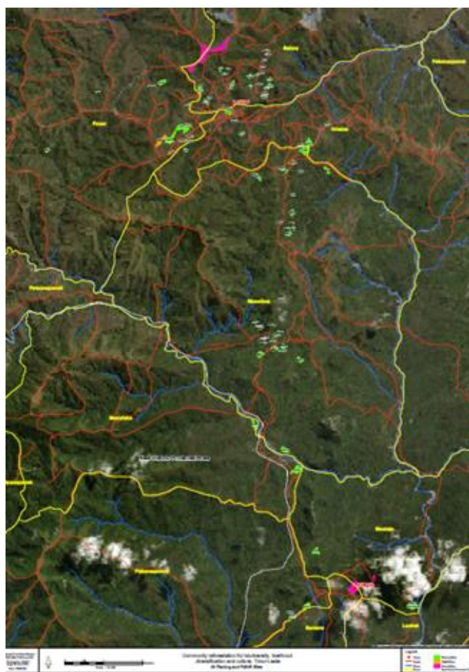
All tree sites (green), cultural sites (pink), FMNR (orange)

Activity 3.4/3.5 Changes to the Gold Standard Carbon Standards in May 2018 around retrospective plantings has created the need to find an alternative scheme (see change request forms). We are now applying to the Plan Vivo standard which is geared more to smallholder contexts in developing countries such as East Timor. We have been in discussions with Eva Schoof from Plan Vivo who is guiding us in developing the Project Idea Note (to be submitted in November 2018) and Project Design Document (to be submitted by June 2019). All the work we have done to date on stakeholder consultation, land mapping, tree growth measurements, social research, farmer agreements and baseline carbon scenario calculations is relevant to the Plan Vivo process.