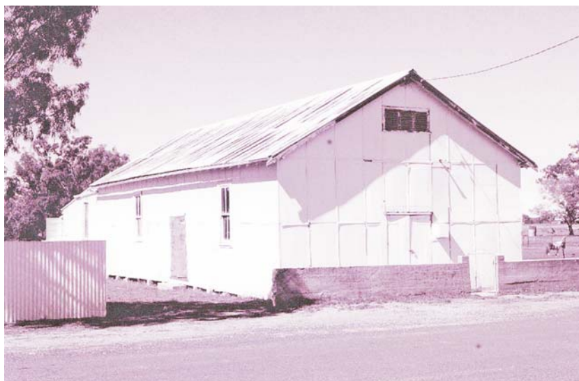
Balladoran Hall 2005, little changed in fifty years.

He was the Teacher-In-Charge of the one room school across the creek from the C.B.D. Almost overnight an aboriginal settlement had been formed on a twenty acre block, also across the creek. Needless to say the new assistant had arrived before a second building so my first classroom turned out to be the supper room of that old, tin shed I had seen from the turnoff. It was the local hall, with a small kitchen area at the rear. In this unlined room I was to have a table, blackboard on an easel, some desks and a group of 18 multicoloured kids in three classes. Twenty yards down the back were two pit toilets with resident redbacks. Forty years later I was in the hall and noted that the directions I had written for opening the school concert curtains were still clearly visible on the wall.