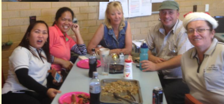
Above – Orange Christmas Party