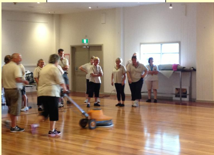
Above– Bathurst Group Training on the new Floor Scrubber.