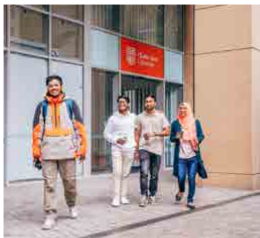
*QS Best Student Cities Ranking 2024 ^ Economist Intelligence Unit Global Liveability Index 2023

Our new campus offers the perfect blend of modern amenities and academic excellence. Along with a wide range of support services, you'll have everything you need to commence an exciting career and establish lifelong connections.