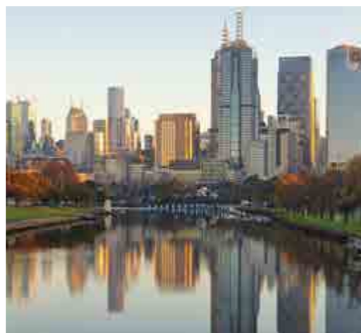
*QS Best Student Cities Ranking 2024 ^ Economist Intelligence Unit Global Liveability Index 2023

Renowned for its comprehensive public transport network, colourful art scene and diverse culture, Melbourne is consistently classed as one of the world's most liveable cities^*. Safe and welcoming with every amenity at your fingertips, Charles Sturt University Melbourne combines vibrant city living with the inclusive culture we're known for.