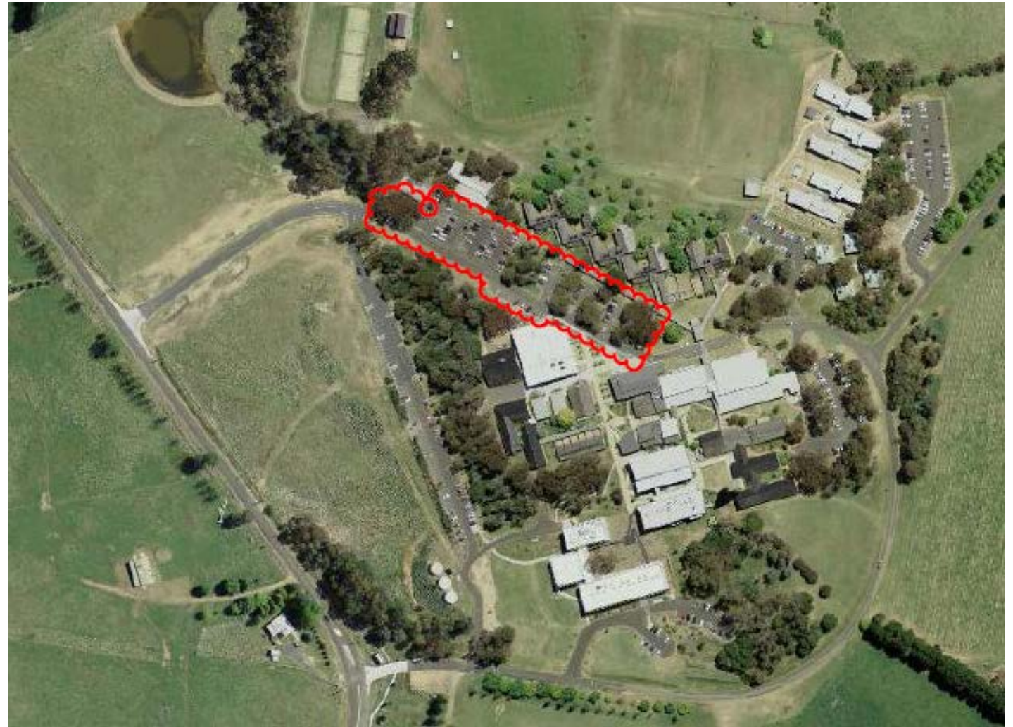
Figure 1 – Campus Plan showing the location of the Road & Carpark upgrade.