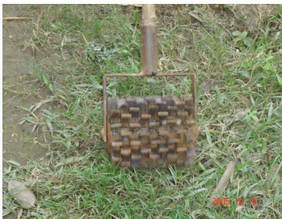
Plate 1 and 2. Farmer-made weeders

to manage the increased labour for the larger SRI fields. To solve this problem, DADO introduced mechanical weeders (cono weeder—a two-wheeled rotary weeder) in 2005. Farmers tried it in different types of soil and situations. One important issue for mechanical weeding was the availability of water on the field to roll the weeder. Furthermore, most of the female labour force felt it was very difficult to roll the weeder on the field, and only male labourers used it in their fields. The rotary weeder cut down the labour requirement of SRI by three-quarters but its use was problematic, particularly because rice weeding is conventionally done by female labourers. Some farmers made their own weeders that were lightweight and easy to operate, (see Plates 1-4) and some maintained closer spacings (20x20 cm) to reduce weed growth. Other farmers used a combination of chemicals (herbicides) and manual weeding for better weed management. These adjustments were done in partnership with the farmers. Strategies were different on different farms and were influenced by water availability, soil type, labour type and labour availability. Based on our joint learning we suggested different weed management strategies for the SRI farmers according to their situations.