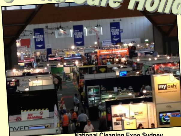
National Cleaning Expo Sydney