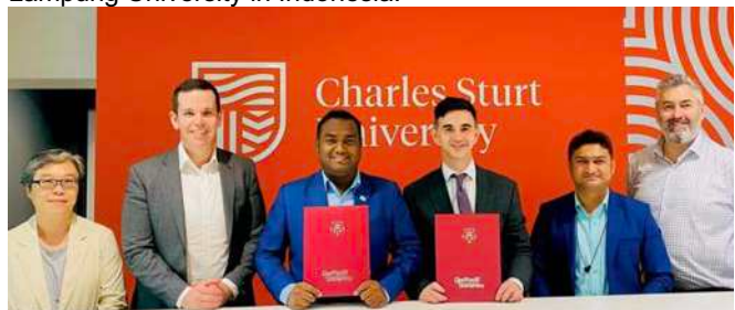
Charles Sturt and Daffodil University representatives in Sydney for the signing of a memorandum of understanding.

Our newest international partners include Daffodil International University and Varendra University in Bangladesh; Lovely Professional University and Parul University in India; Xiangnan University in China; and Lampung University in Indonesia.