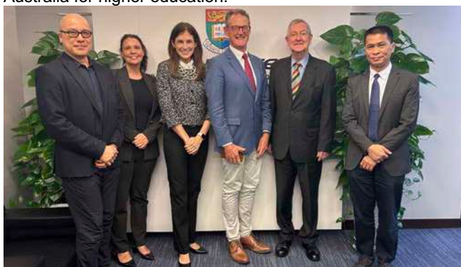
Charles Sturt representatives in Hong Kong meeting with education partners.

In addition to the partner meetings, training sessions were conducted with our Hong Kong education agents to promote our allied health courses. Physiotherapy and occupational therapy are top priorities for Hong Kong students headed to Australia for higher education.