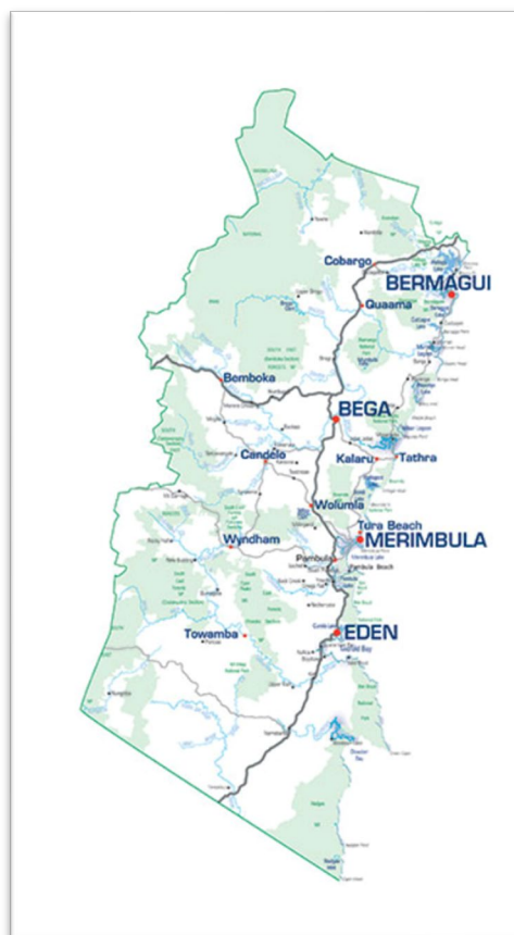
Figure 4: Map of Bega Valley Shire Local Government Area (LGA)

Land is used primarily for conservation and timber production. The next biggest land use is agriculture, particularly dairy farming. Fishing, oyster harvesting, tourism and retail are also important industries.