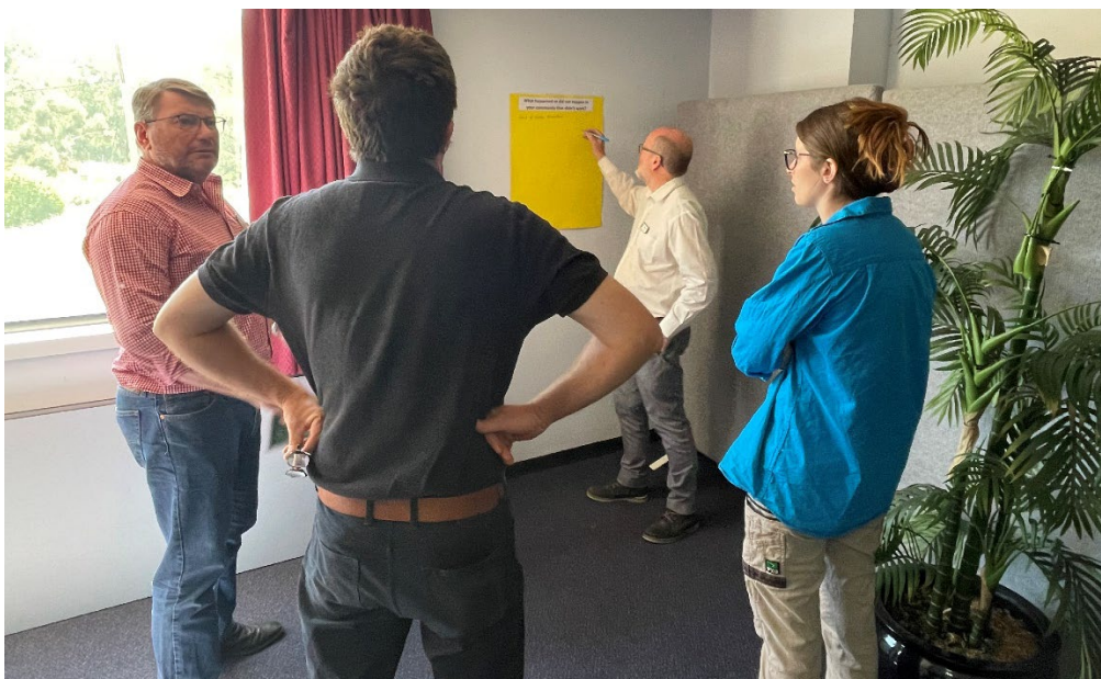
Figure 1 - sharing experiences at the Deniliquin Preparing With Hindsight Forum