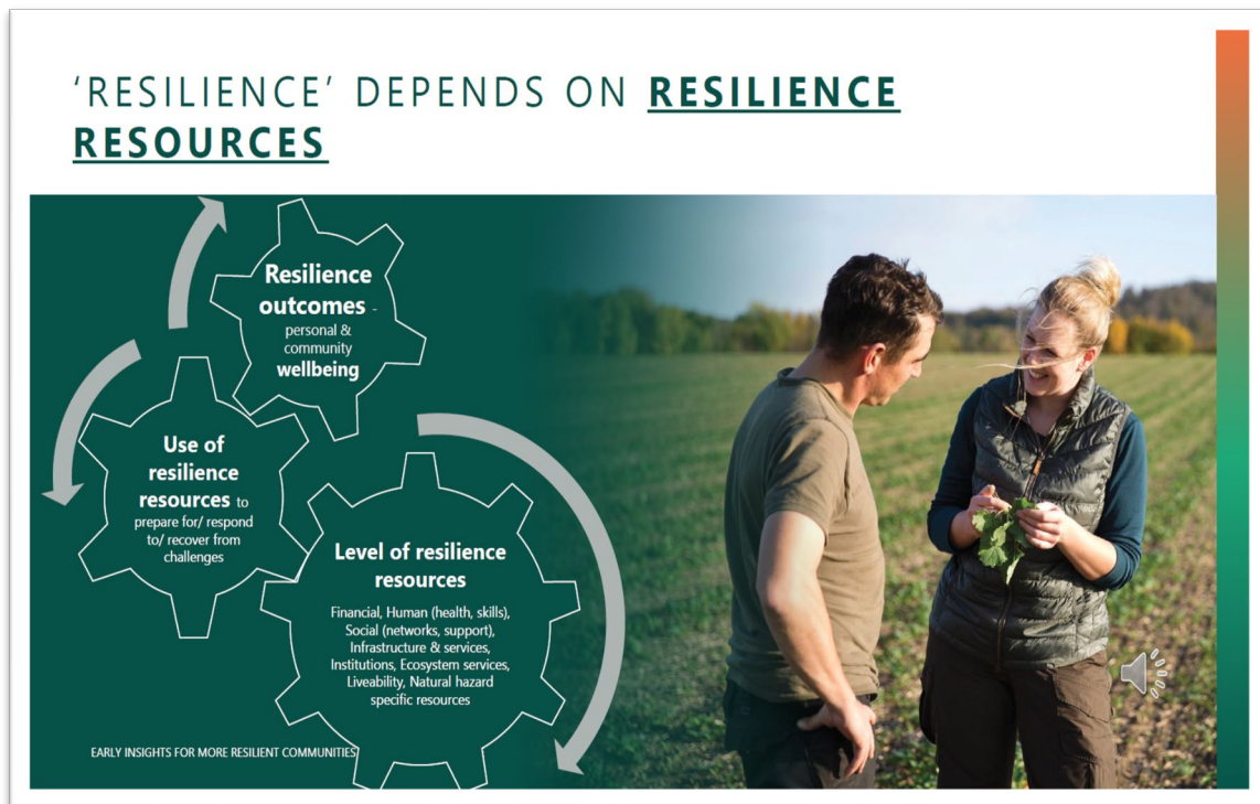
Figure 1: 'Resilience' depends on resilience resources – slide from Early Insights for More Resilient Communities presentation given at Preparing with Hindsight Forums

To date, a total of 36 community stakeholders have participated in Preparing with Hindsight Forums, and future Forums will be held in Broken Hill and Mudgee later in 2024. To prepare for these Forums, maximise attendance and ensure a diverse range of community perspectives are captured, initial online planning meetings have taken place with community leaders in Broken Hill and Mudgee.