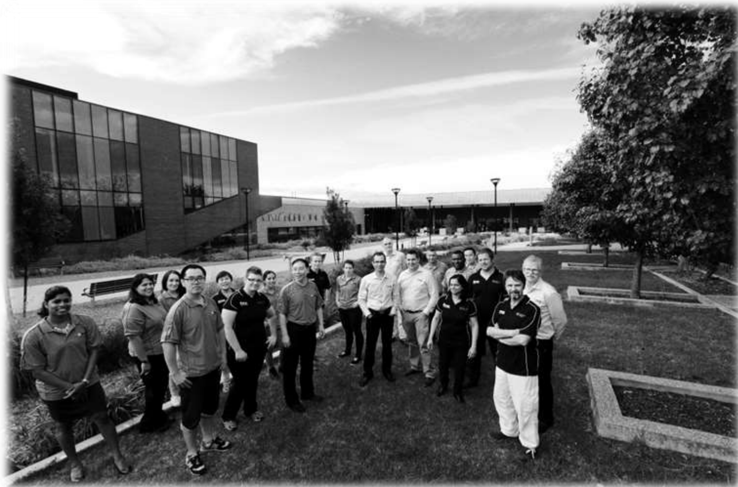
ARC Industrial Transformation Training Centre for Functional Grains