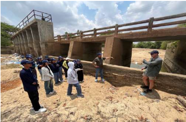
Gulbali researchers conducting field work with Cambodian students at a fish ladder in Cambodia.