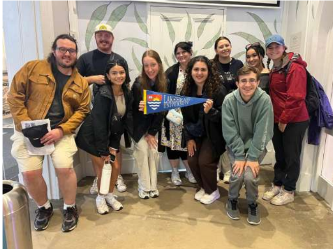
Lakehead University students from Canada on a recent inbound study tour to Charles Sturt and New South Wales.

The Charles Sturt Global team have recently hosted 10 students and 1 academic from Lakehead University for a 10-day study tour focussed on indigenous culture, diversity and inclusion at our Bathurst campus.