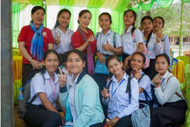
CSU-ACA members with Cambodian students during recent Women Bright Program activities.

If you have an inspirational international alumni story to share, please let our Advancement team know ( alumni@csu.edu.au ).