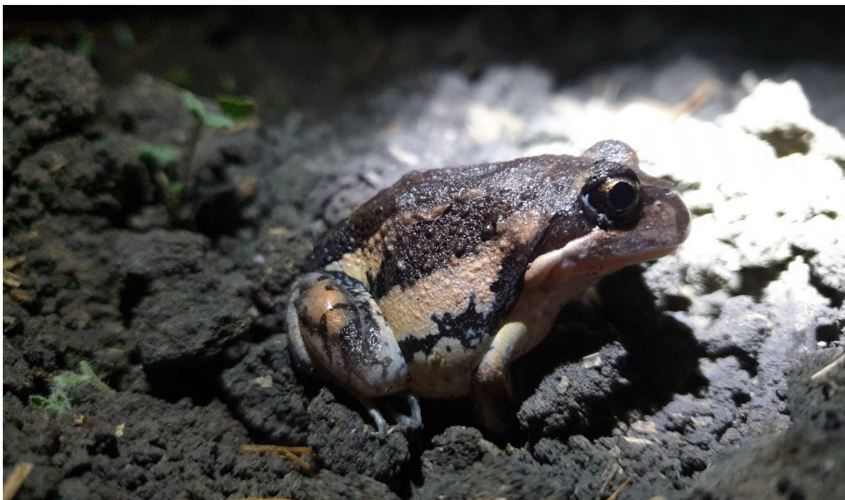
Inland banjo frog observed at Two Bridges Swamp, March 2020

Frogs and tadpoles: As expected, calling activity has now largely ceased for the season, with no calling activity recorded across the Lowbidgee sites. Frogs were continuing to call in small numbers at all wet sites in the mid-Murrumbidgee, with four species heard calling at Sunshower Lagoon (barking and spotted marsh frogs, Peron's tree frog and plains froglet). The absence of southern bell frog records during this monitoring period is most likely related to low numbers and hence low probability of detection. The southern bell frog population at Sunshower is expected to increase with the use of environmental water to maintain more natural flow regimes, restore wetland vegetation and create breeding opportunities.