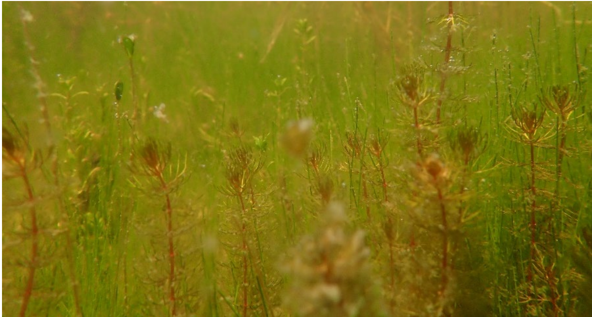
Submerged aquatic vegetation – red watermilfoil and small spike rush at Eulimbah Swamp, March 2020

In Yanga NP, Mercedes Swamp contains residual water in the main body, with several larger carp (deceased) noted at the deepest point. Two Bridges Swamp, Piggery Lake and Waugarah Lagoon are dominated by colonising annuals including common crumbweed, heliotrope and small amounts of common sneezeweed.