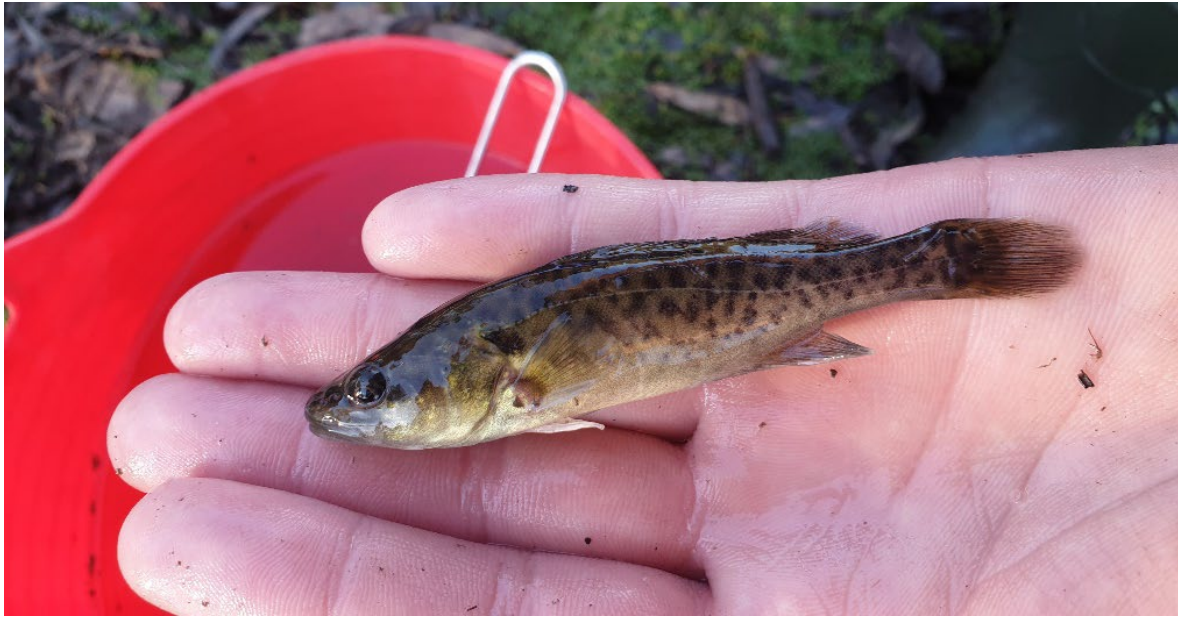
Juvenile Murray cod captured at Mantangery Lagoon, March 2020

No fish were detected at Sunshower Lagoon, however dissolved oxygen levels have improved from <1.0mg/L in January to over 5.0mg/L and captures included shrimp, tadpoles (57) and eastern long-necked turtles (3).