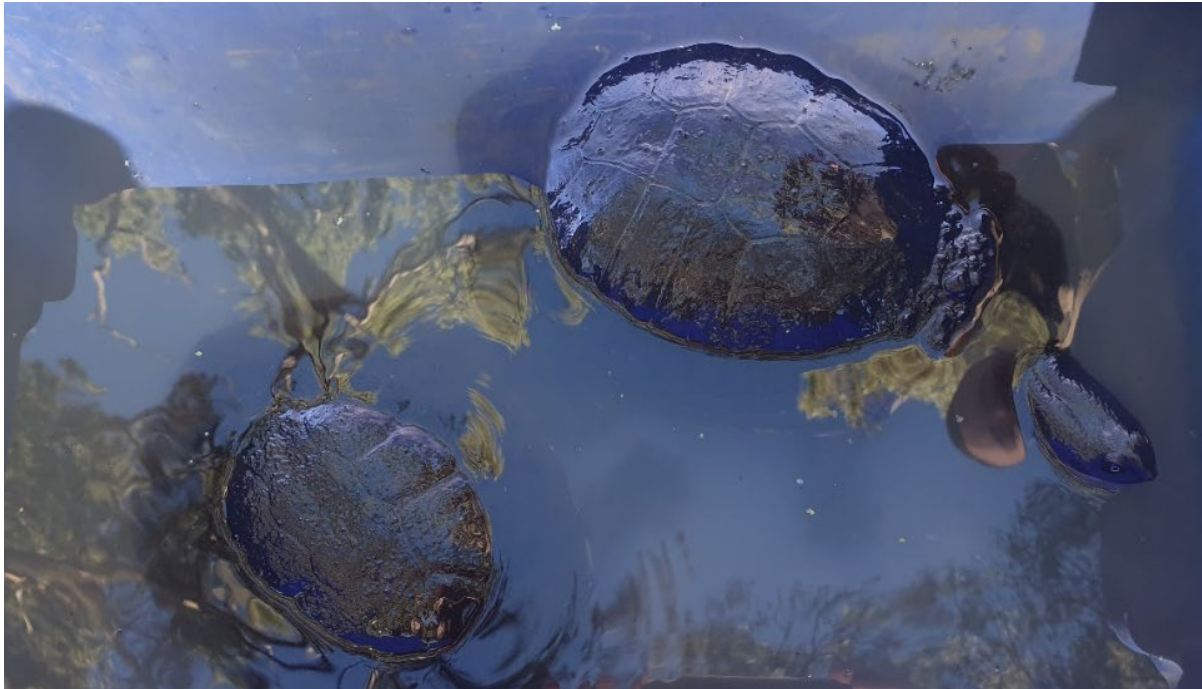
First eastern long-necked turtles recorded at Sunshower Lagoon since watering commenced late last year, March 2020

Turtles: Two turtle species (eastern long-necked and broad-shelled turtles) were captured during March monitoring activities. A juvenile broad-shelled turtle was detected at Waugorah Lagoon, and three eastern long-necked turtles were captured at Sunshower Lagoon. These are the first turtles detected since the wetland was filled in December 2019. A broad-shelled turtle was detected at Yarradda Lagoon for the first time since January 2018.