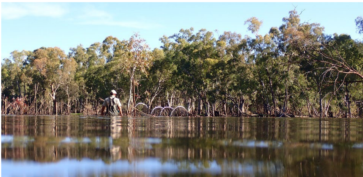
Netting at Mantangery Lagoon, March 2020

Routine wetland monitoring activities targeting vegetation, water quality, fish, frogs and tadpoles were completed at five sites. Three sites (Piggery Lake, Mercedes Swamp and McKenna's Lagoon) were completely dry, and two sites contained insufficient water for netting (Two Bridges, Nap Nap Swamp). Mantangery Lagoon was monitored as an alternative wetland in the mid-Murrumbidgee. Waugorah Lagoon was full, and Avalon Dam, Eulimbah Swamp and Telephone Creek were inaccessible due to the Covid-19 shutdown of the Gayini Nimmie-Caira reserve.