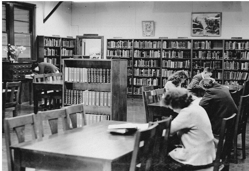
The Wagga Wagga Teachers College Library 1950