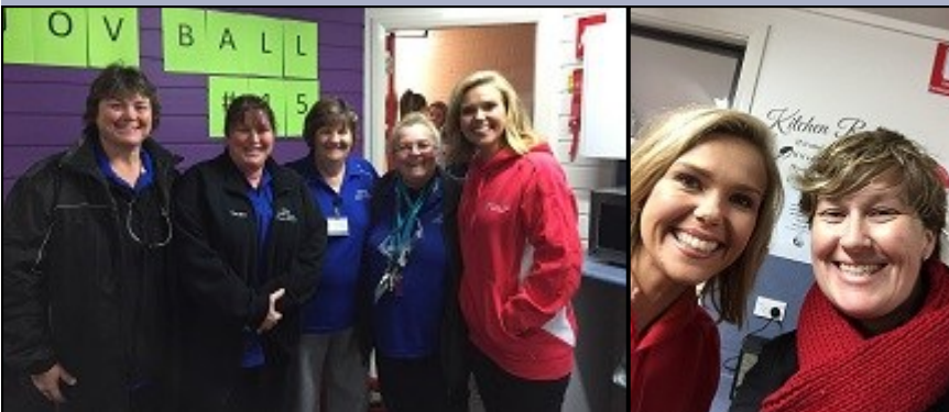
Above: The Bathurst Team doing a great job preparing for the Sunrise TV show

"I wanted to phone to say "you have knocked this unit out of the ball park what a great effort :)"