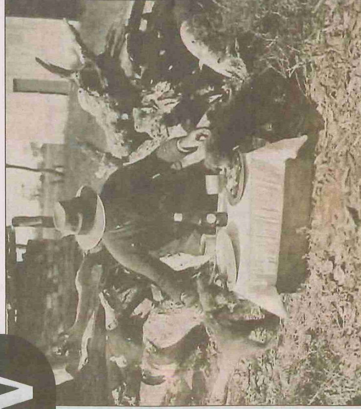
From the Alfred Greene collection (RW1247/3): "Oreel Shed, 1928 – You sit up and eat properly."

■ The CSU Regional Archives are open Monday to Friday, 9am to 5pm. Located in the Blakemore Building on South Campus of the university, access can be gained via College Avenue or Hely Avenue. Members of the public are welcome to visit the search room, where professional archival staff can assist with inquiries. For those people unable to visit the archives in person, staff can provide a research service for straight-forward inquiries for a fee of $55 per hour including copying and postage. For further information, phone 02 6925 3666, email archive@csu.edu.au , or visit our website at www.csu.edu.au/research/archives for a full listing of holdings and more detailed information.