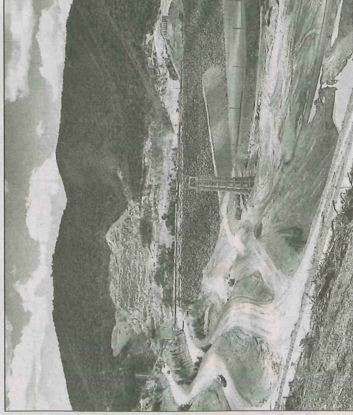
From the Murray Valley Development League collection (RW214/89): "The 370-foot high rockfill Blowering Dam during construction. Storage of water will commence in 1968".