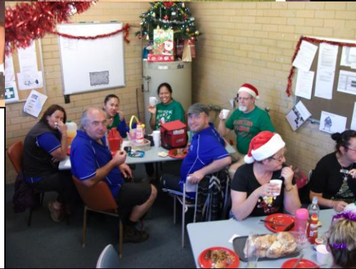
Pictured Above (Right): Some of the Orange staff enjoying their Christmas BBQ and Secret Santa. A very enjoyable time was had by all!