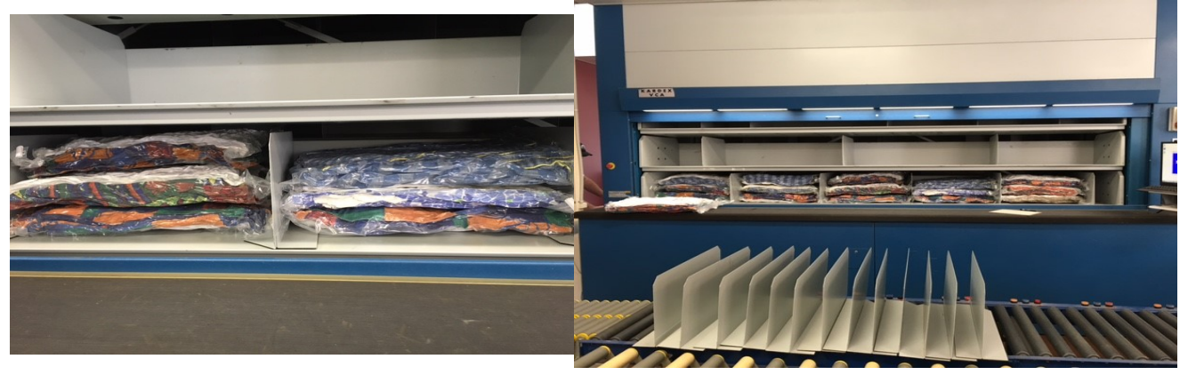
Pictured above: New linen packs stored at the distribution Hub in Wagga, and a new system for keeping CSCS linen stock.