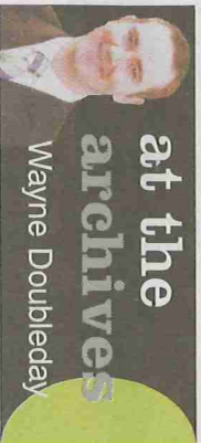
at the archives Wayne Doubleday

here is a short, but vital stretch of road between Trail and Best streets in Wagga, named in honour of a man named Ivan Jack.