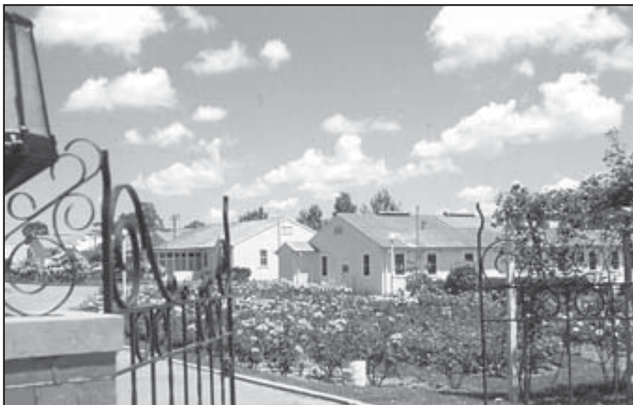
Admin Block from Gilmore gates 1960

since it commenced in 1947 in old unwanted buildings that had been a RAAF hospital.