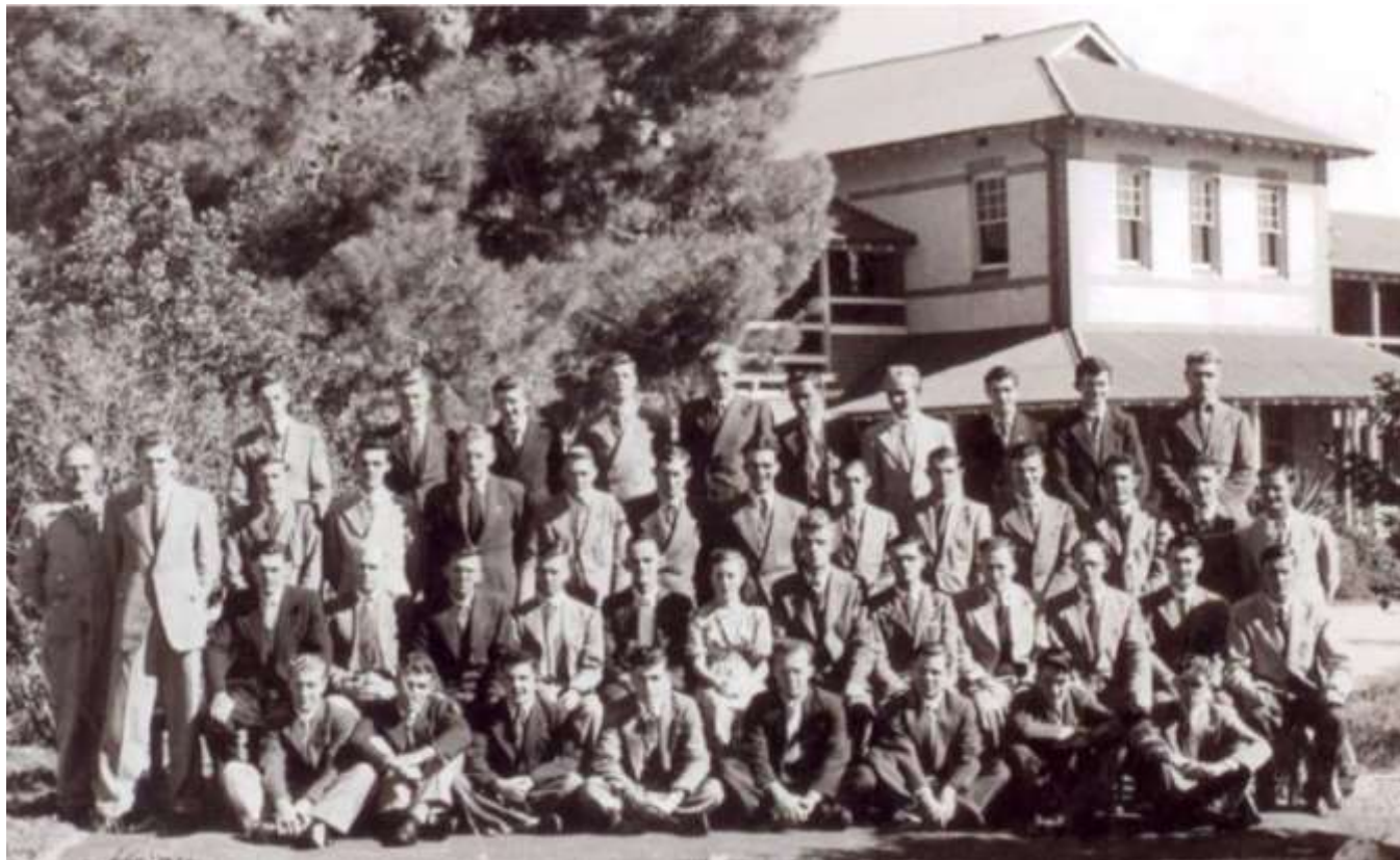
Wagga Agricultural College staff and students around the time of its establishment in 1949