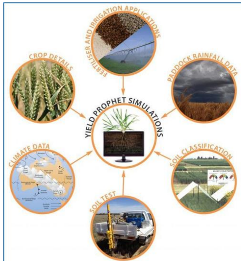
Figure 1. Schematic representation of inputs into Yield Prophet

2010). This was clearly illustrated by the proliferation of the concepts of PAW at sowing and PAWC of soils in these communities of practice and in the continuing widespread use of hydraulic soil coring equipment to facilitate their measurement. After a period of joint research and development, BCG assumed the management of Yield Prophet® as an income generating subscription-based service which was still active in 2019. By 2018, 1,686 growers supported by 377 advisers had subscribed 4,949 unique paddocks distributed throughout the grain zone (Figure 2). While the number of growers directly involved was a relatively small proportion of Australian grain producers, they tended to be the leading growers who communicated learnings well beyond their farms.