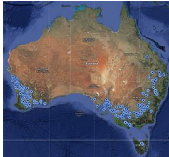
Figure 2. Location of weather stations used for Yield Prophet paddocks in 2014

Ten years after the completion of the FARMSCAPE project, these largely-intuitive farmers were still highly enthusiastic about the analytic approach that integrated soil water data with simulation of management options. Yield forecasting and tactical decision making, had served farmers as ‘management gaming’ simulations to aid formulating action rules for such conditions, thus reducing the need for an on-going decision-aid service (McCown et al. 2012). This preference for intuitive rather than analytic decision-making helps explain why, while some growers continue to use Yield Prophet® as a decision tool for many years, most growers use it for one or two years only.