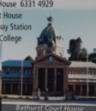
Bathurst Court House

Distributed by Dennis the Dinosaur, promoting the City of Bathurst. Dennis-the-Dinosaur-Bathurst. Design & print by Central Commercial Printers.