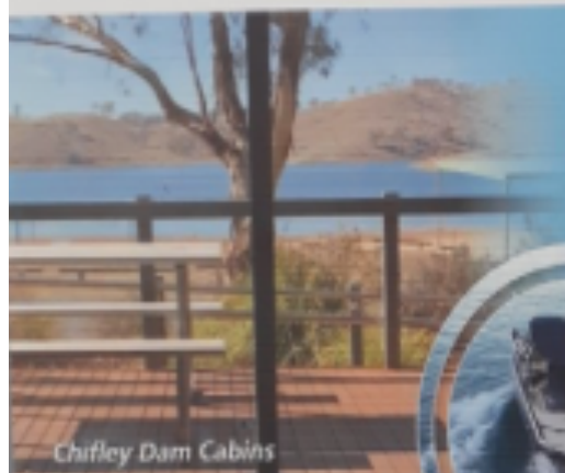
Chifley Dam Cabins