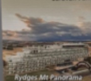
Rydges Mt Panorama

Boutique, Modern Resort, Caravan Parks, Motels & Hotels