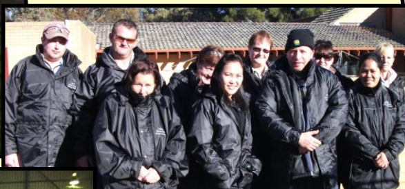
Above – The team members at Orange CSCS may only be small in numbers but continue to do an great job and moulded into an excellent team with all willing and wanting to assist others to complete their tasks to an high standard. Congratulations to all.