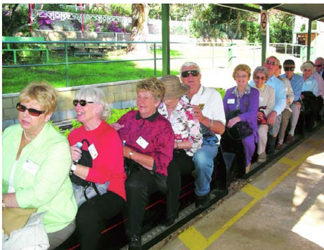
Enjoying the miniature train ride to the Museum