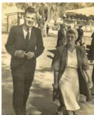
Photos of them – on their way (with their mothers!) to Wagga Teachers College.