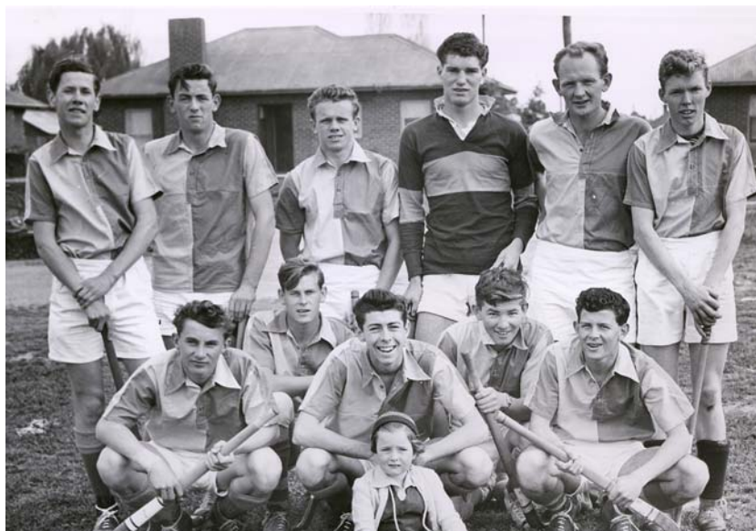
WWTC 1 st XI Hockey Team – 1 st Grade Premiers 1955