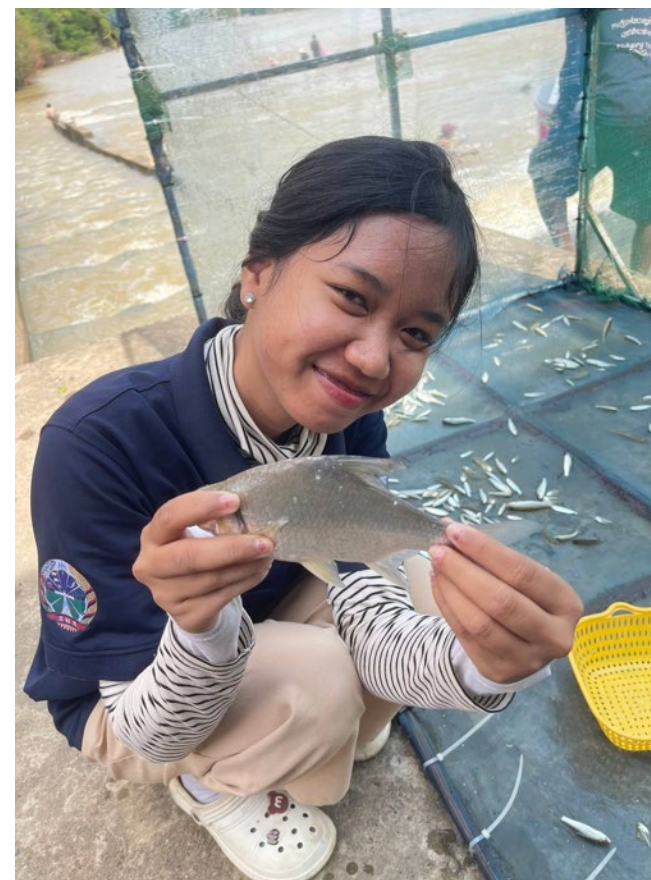
Team member from Inland Fisheries Research and Development Institute, Cambodia