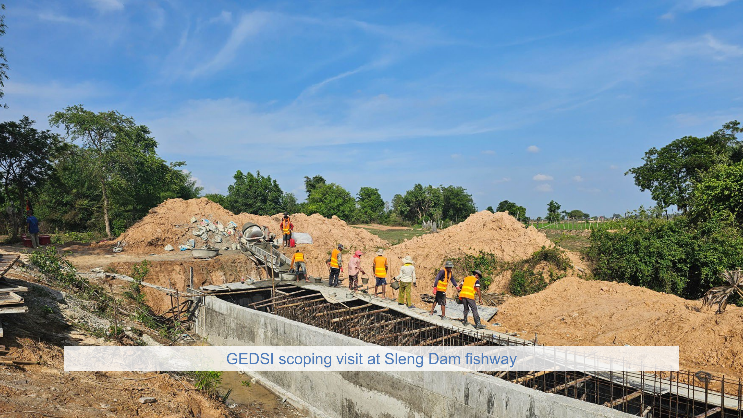
GEDSI scoping visit at Sleng Dam fishway