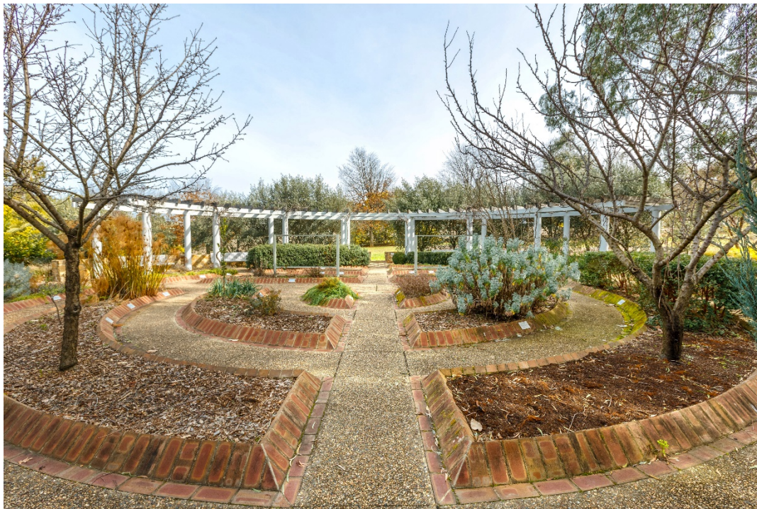
The Bible Garden