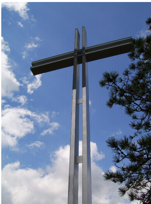
The Great Cross

We behold your glory, O God, in the love shown by your Son, lifted up on the cross and exalted on high: be glorified anew in the love we have for one another as disciples of the risen Lord Jesus, who lives and reigns with you, in the unity of the Holy Spirit, one God, for ever and ever. Amen.