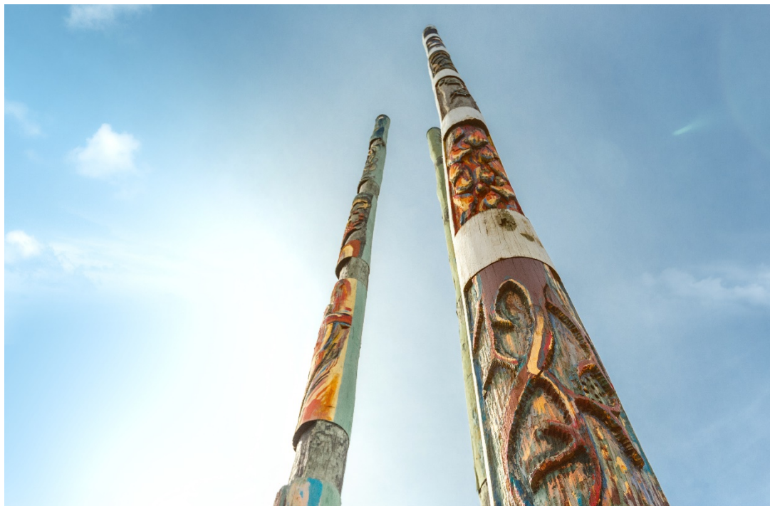
The Pilgrim Poles