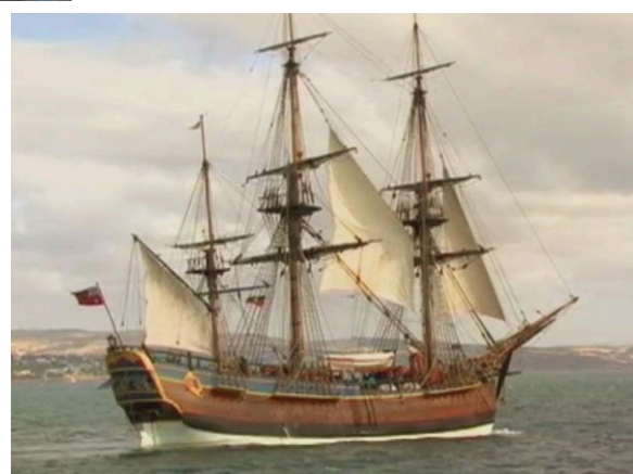
Lt James Cook's ship "Endeavour"

BTCAA SCHOLARSHIP WINNERS ---- This is an overview list of BTCAA Scholarship Winners since 2008. As you can see they have often come from communities faced with the vagaries of drought, flood and fire. It is clear from feedback from these awardees that the award has been significant in assisting the winner to complete their studies in their chosen fields.