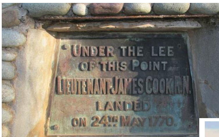
Plaque inscription at Seventeen Seventy memorial in the Gladstone region QLD