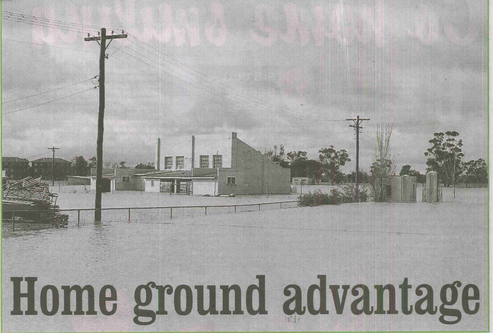
Robertson Oval under water during the 1956 flood.

The next Saturday opening will occur on September 1, from 10am to 3pm.