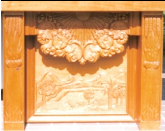
ALTAR CARVING (DETAIL)