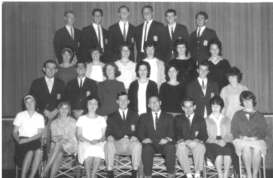
Junior Secondary Group 1963-63