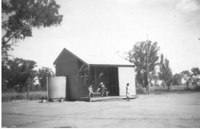
Rennie Provisional School 1952

You may recall the story of my first appointment to Rennie in 1952, which was published in Teaching Memories. I have since discovered a couple of photos of the school. The story behind these photographs is as follows.