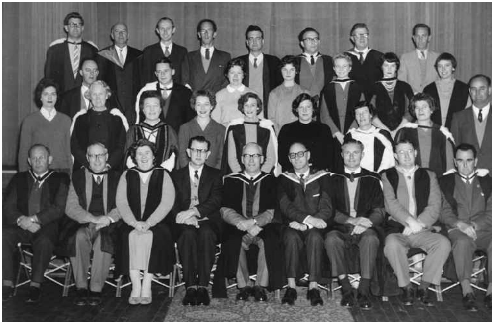
The Wagga Wagga Teachers' College Lecturing Staff 1961