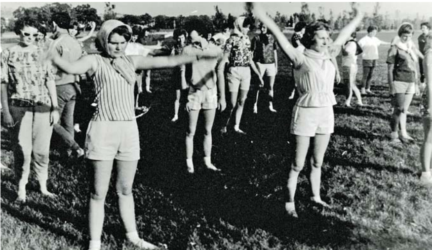
Early Morning Exercises—The Girls Go Through Their Paces.